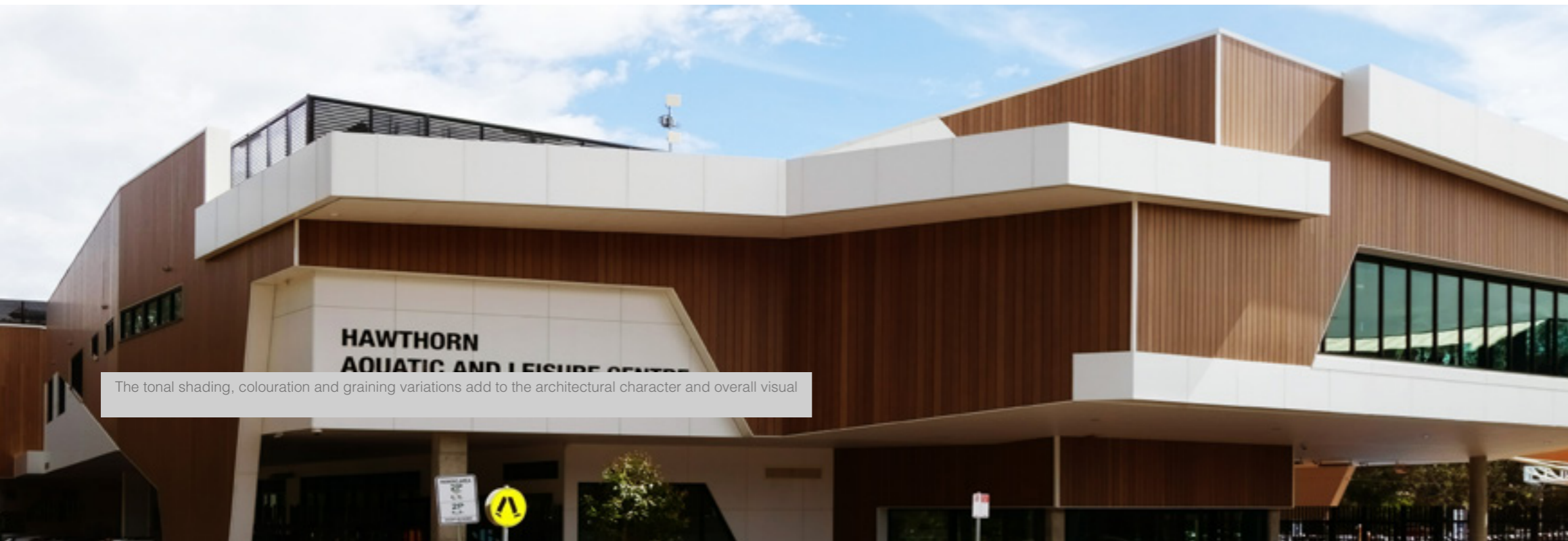
The tonal shading, colouration and graining variations add to the architectural character and overall visual

* Guide only, span based on non reinforced section and is dependent on region and wind load.